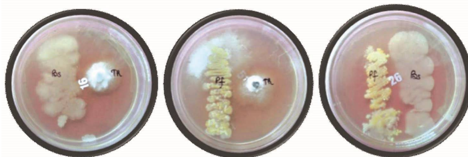
Fig. 2. Compatibility among T. harzianum , Bacillus subtilis and Pseudomonas fluorescens .

tested on the basis of inhibition zone. Studies revealed that no such zone was formed between fungal and bacterial bio-agents indicating that these were compatible with each other (Fig. 2). Jain et al. (2011) studied compatibility among P. fluorescens , B. subtilis and T. harzianum and found that all the three microbes were compatible with one another. Belkar and Gade (2012) studied compatibility of P. fluorescens with beneficial microbes. Among 15 isolates, 6 were most compatible with T. harzianum while 8 were the best compatible with B. subtilis . The results of in vitro studies revealed the supremacy of treatment T 6 (Seed treatment with 1% T. harzianum + 2%