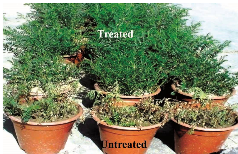
Fig. 3 Effects of chickpea seed treatment with T. harzianum , B. subtilis and P. fluorescens (alone and in combination) on wilt incidence in chickpea.

incidence in wheat. The results demonstrated that T. harzianum with P. fluorescens and B. subtilis in consortia increased the growth and controlled the severity of wilt in chickpea plants. Thaware et al. (2017) made in vitro studies on the efficacy of T. harzianum , P. fluorescens and B. subtilis against Fusarium oxysporum f. sp. ciceris and observed that fungal and bacterial bio-agents